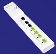
Smart power strips