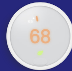
ENERGY STAR certified smart thermostats*